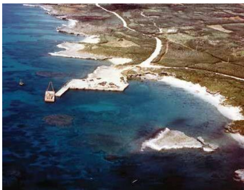
昭和 47 年 11 月