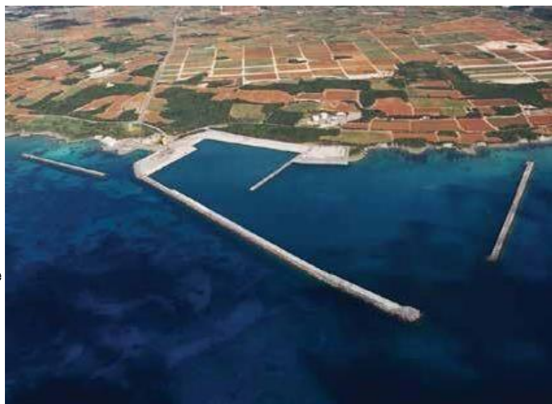
平成 18 年 11 月